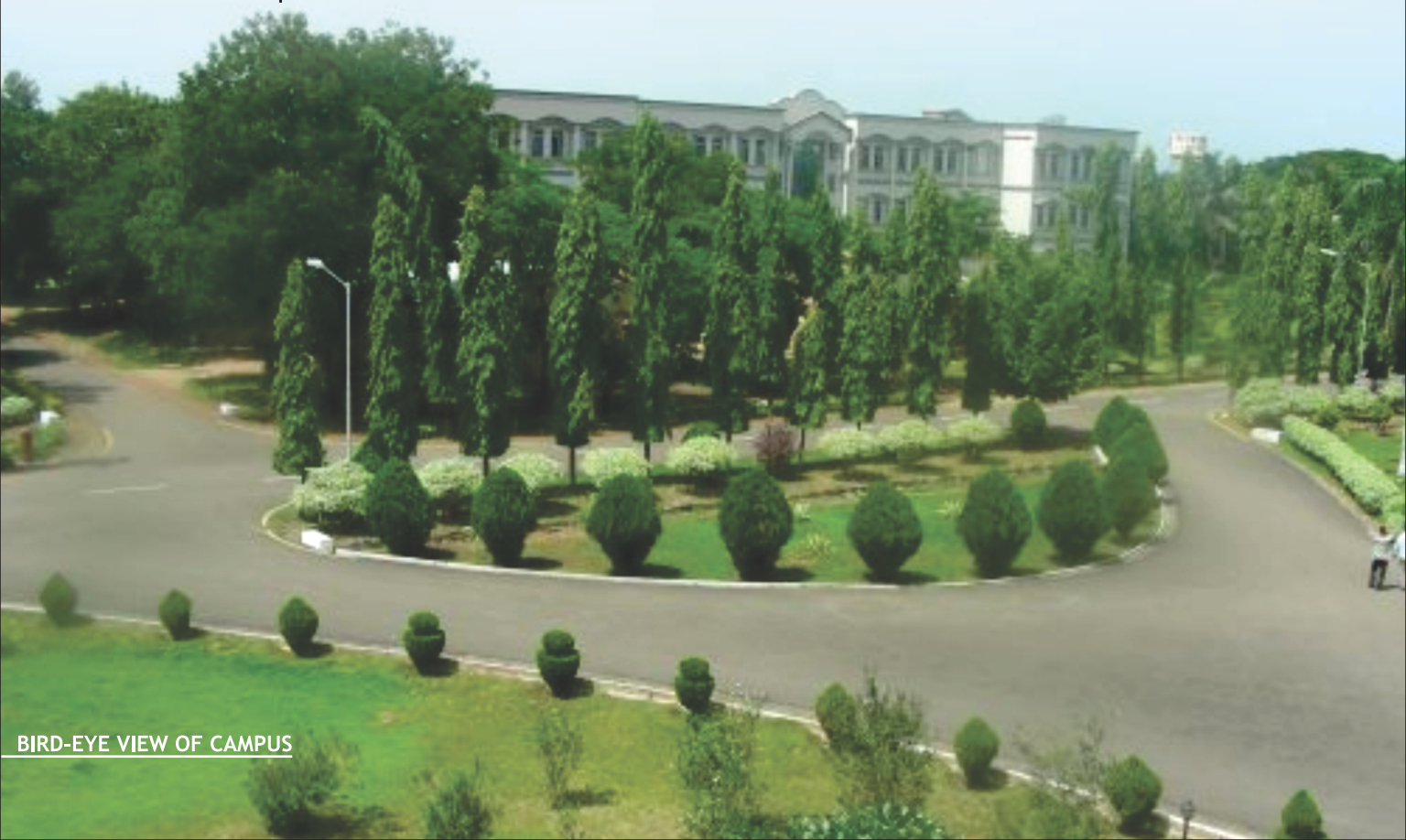
BIRD-EYE VIEW OF CAMPUS